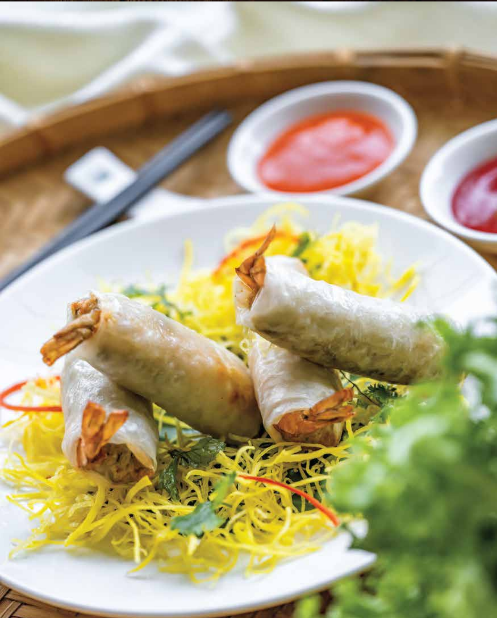
Fried Spring Rolls / Chả Giò Chiên