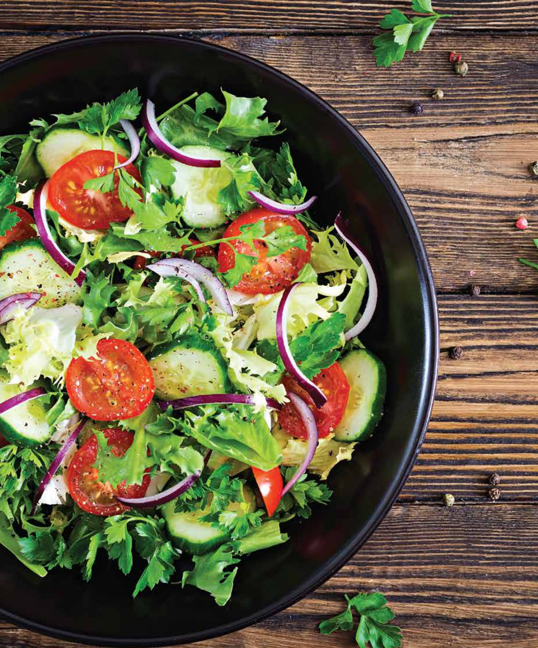
Mixed Garden Salad / Salad Vườn