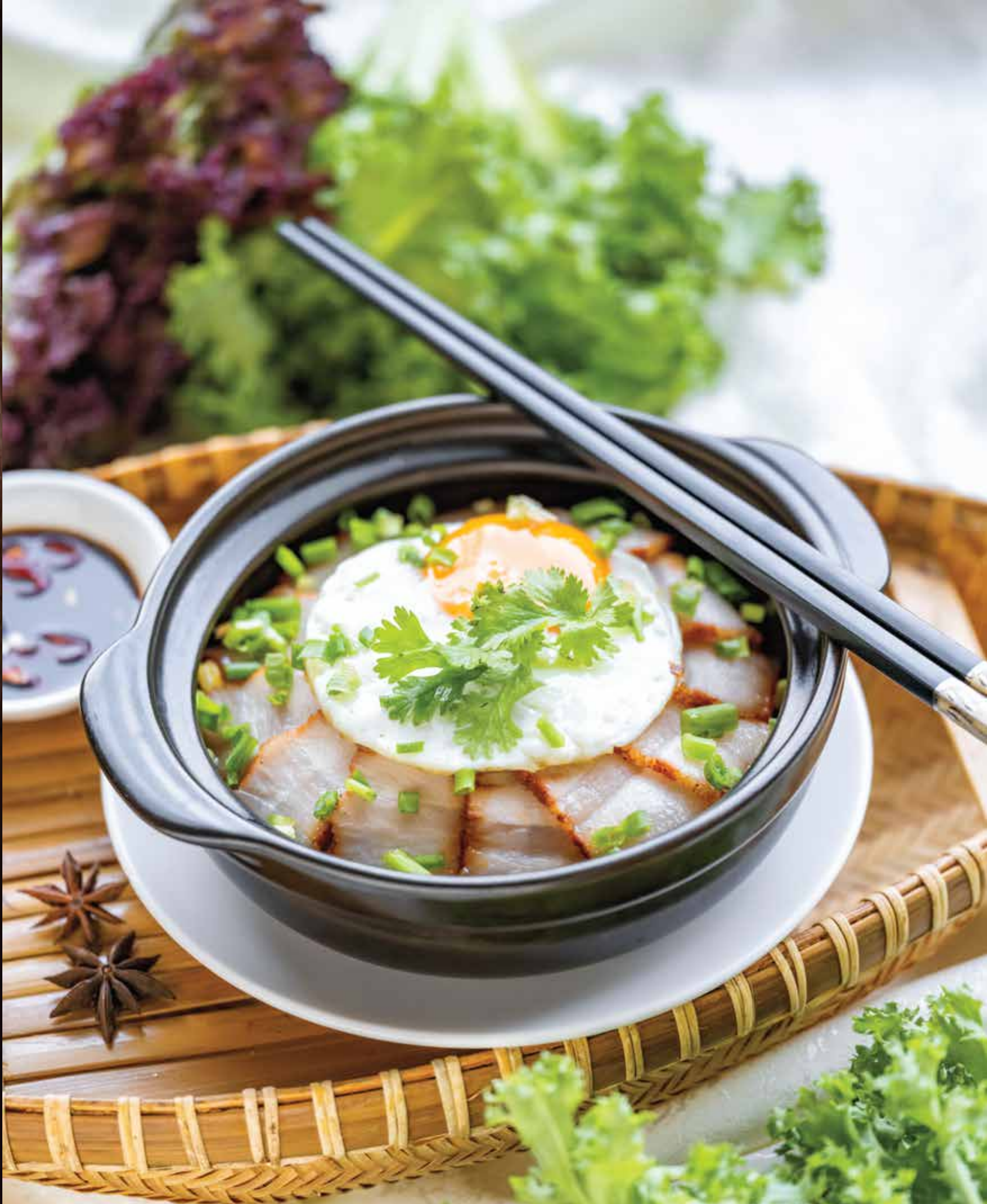
Char Siu Pork Fried Rice / Cơm Chiên Thịt Xứ