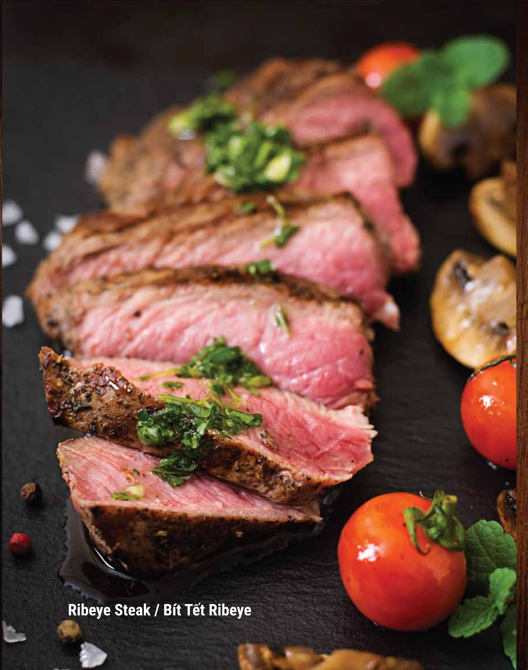
Ribeye Steak / Bít Tét Ribeye